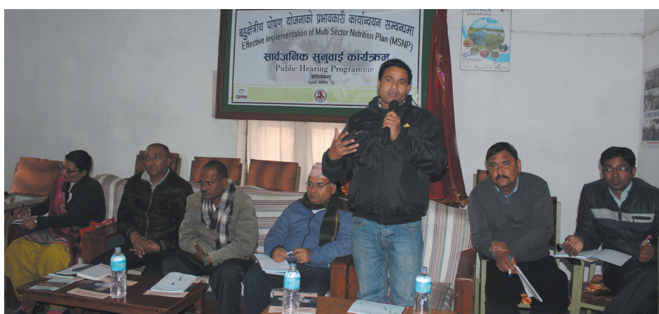
Public Hearing in Kapilvastu