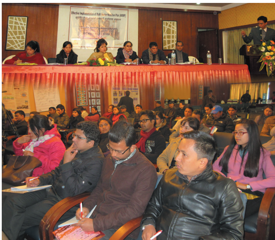
Centre Level Public Hearing