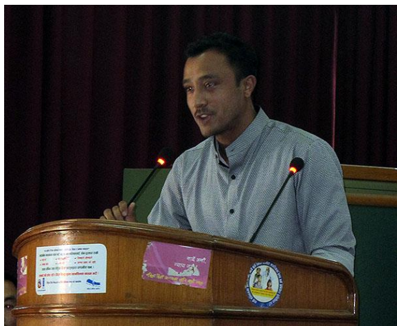
Mr. Paras Khadka, Captain Nepal Cricket Team

and also gave his commitment that he will spread positive messages in all his cricket and other forums. He pledged to mobilize the entire cricket team to carry forward the campaign messages. He concluded his remarks by wishing the campaign success and pledged his commitment towards this good cause.